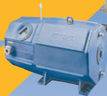
Integrated Motor Pump