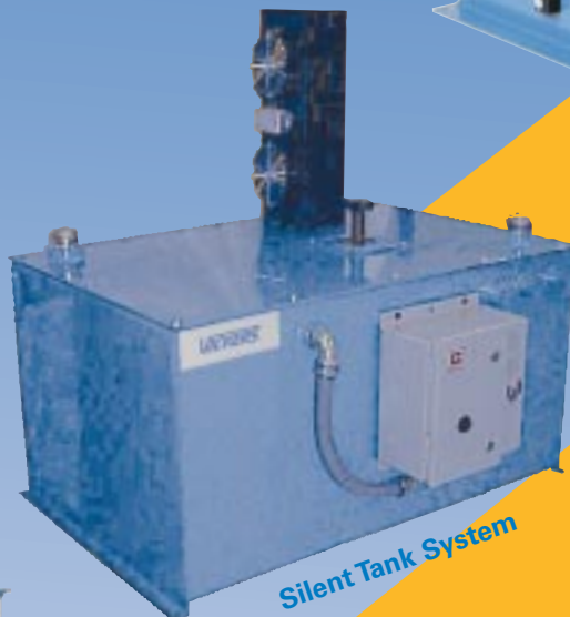
Silent Tank System